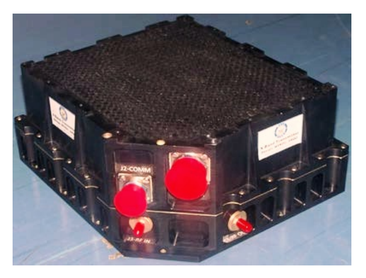
Fig. 2 The engineered model of the X-Band MPM