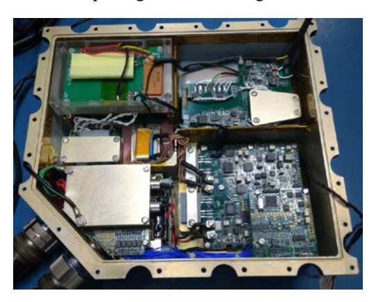
Fig. 3 EPC Modules Assembly

Heater and BFE Modulator Module (HMM) is multi-output half bridge converter powering the heater and BFE of the TWT. The EPC is packaged as shown Fig 3.